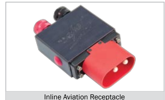
Inline Aviation Receptacle