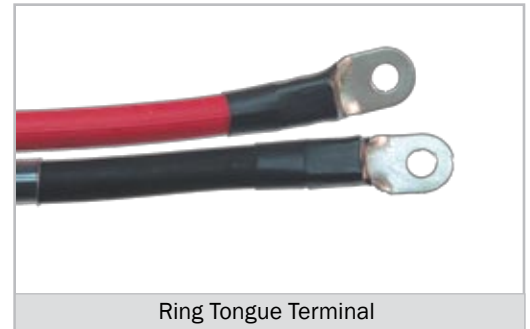
Ring Tongue Terminal