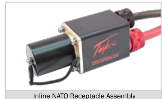
In-line NATO Receptacle Assembly