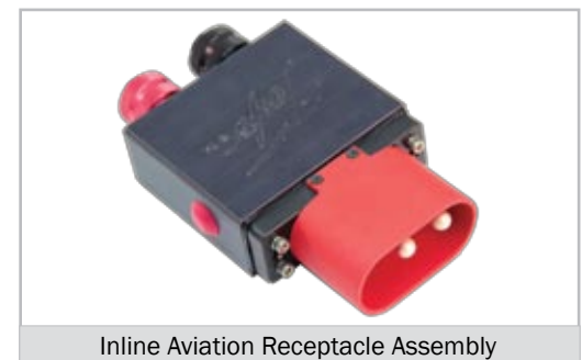
Inline Aviation Receptacle Assembly