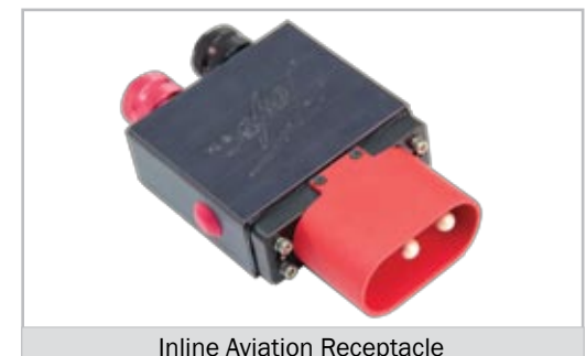
Inline Aviation Receptacle