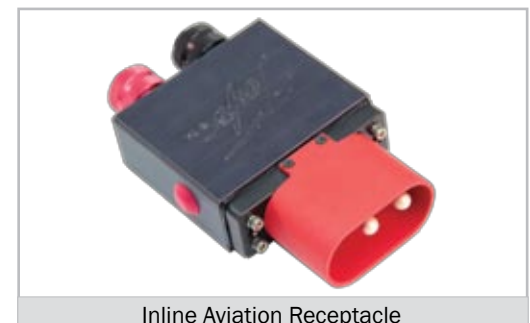
Inline Aviation Receptacle