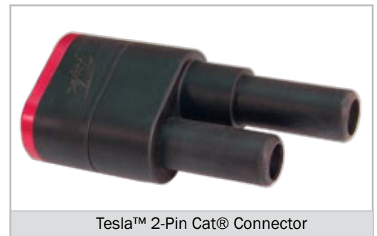
Tesla™ 2-Pin Cat® Connector