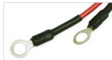
TI2010-096 12/24V Cable Assembly Quick Disconnect DC Output with Ring Terminals.

All models of the TI150 Series Battery Charger/Conditioner are equipped with DC Output Cable Quick Disconnect cable ends. They come in two styles, shown below.