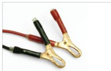
TI2010-095 12/24V Cable Assembly Quick Disconnect DC Output with Alligator Clamps.