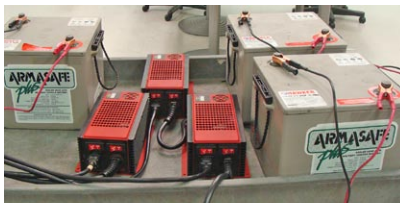
Battery Charger/Conditioner shown charging 12 V Hawker batteries using the Quick Disconnect Cable with Alligator Clamps.

All models of the TI150 Series Battery Charger/Conditioner are equipped with DC Output Cable Quick Disconnect cable ends. They come in two styles, shown below.