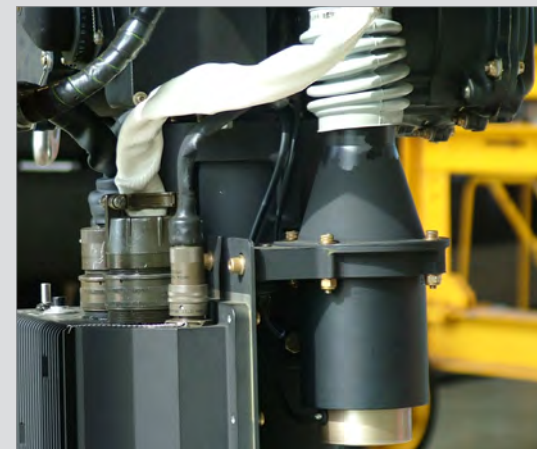
Figure 2: Attaches easily to DC input on helicopter rescue hoist.