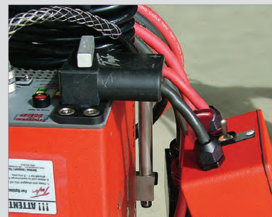
Figure 3: Rescue hoist control attached to a Tesla GPU.