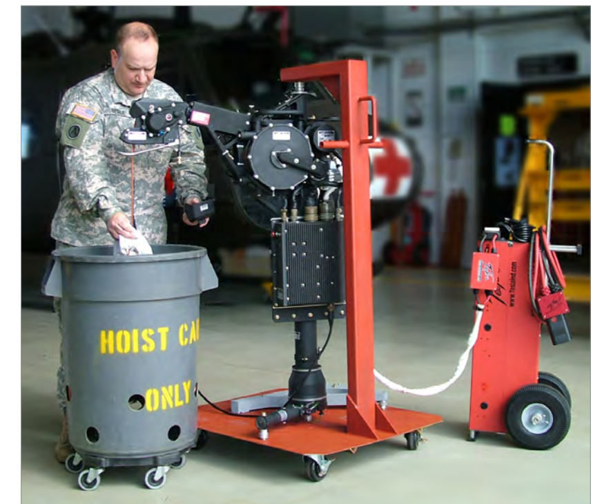
Figure 7: The TI2006-308 DC Universal Hoist Control Cable is designed to withstand daily military testing.