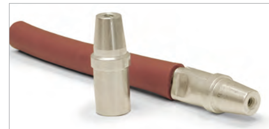
Figure 5: DC Plug Replacement Contacts: TI2005-490