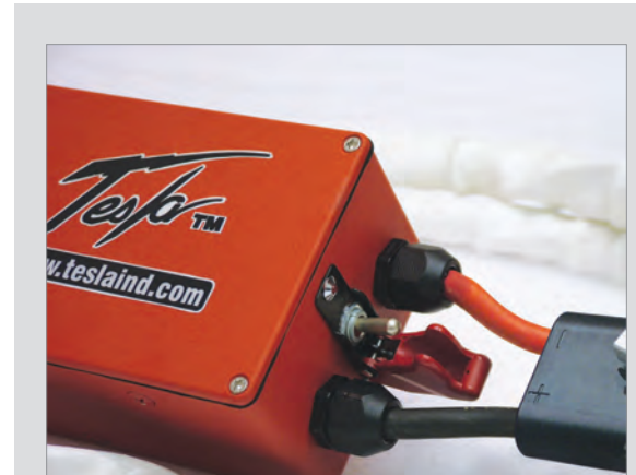
Figure 1: Power at the flip of a switch.

The Tesla™ Universal Rescue Hoist Control DC Plug can be easily repaired by replacing the contacts using the Insertion/Extraction Tool pictured in Figure 6. The tool and replacement contacts can be ordered through Tesla™ Customer Service at 302-324-8910.